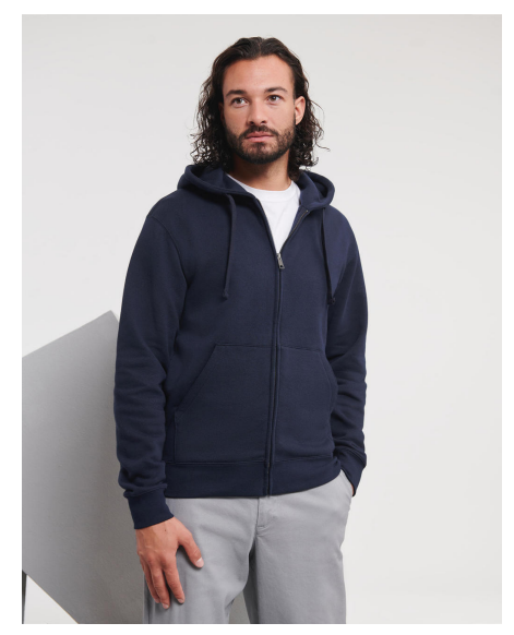
Commodity Code: 61102099 Country of Origin: Cambodia